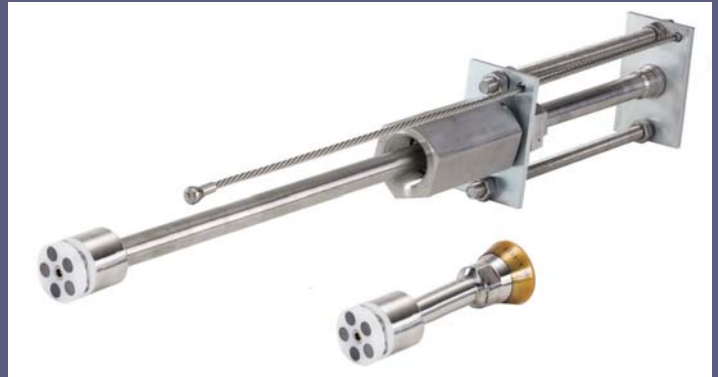
Cosasco Model 6205 and 6215 Bio-probes

Cosasco Model 6205 and 6215 bio-probes provide an economical and safe means of collecting samples of sessile bacteria deposited on the metal surface in the process. The bio-probes have five sample elements, each with an exposed frontal area of 1cm 2 . Each time a sample is required for analysis a successive element is removed and replaced with a new one, leaving the other four in place. With this successive change of elements, a longer exposure is obtained for each element, but still permits a relatively frequent sample to be taken for analysis.