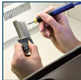
Oxide removal from turbine blades