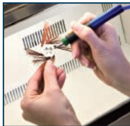
Epoxy removal from probe rings