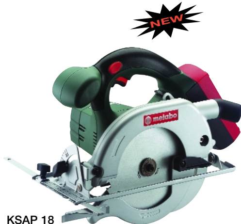
KSAP 18 Circular Saw