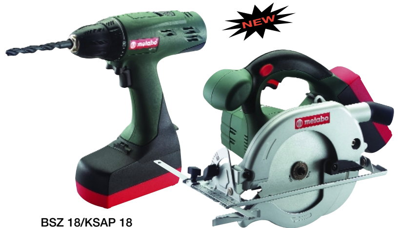
BSZ 18/KSAP 18 18V Drill/Driver and Saw Combo Kit